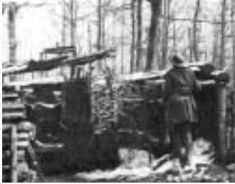
Troop in Outpost Before Destruction