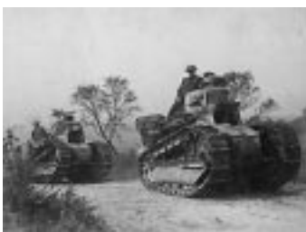
Troops Going to Battle in Tanks