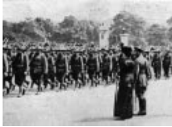
Troops at Buckingham Palace