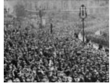
Troops at Trafalgar Square