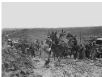
Troops Hauling Ammunition Wagons