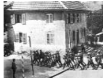
Troops Crossing German Frontier