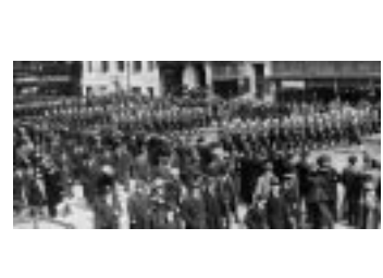
Troops in New York