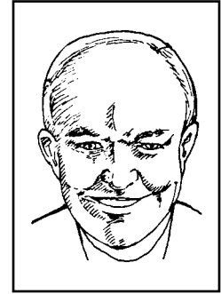
Dwight D. Eisenhower

"We will accept nothing less than full Victory!"