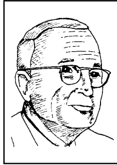
Harry S. Truman

"...The force from which the sun draws its power has been loosed upon those who brought war to the Far East."